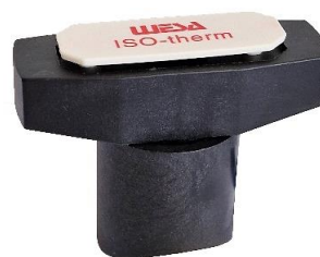
Size: 1/2" up to 1 "