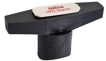
Size: 1 1/4" up to 2 "